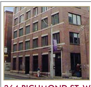
364 RICHMOND ST. W. 3rd Floor: 6,000 SF 4th Floor: 8,000 SF Total: 14,000 SF