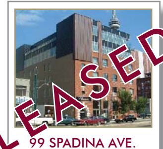
2nd Floor: 7,968 SF 3rd Floor: 8,030 SF