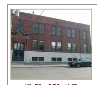
47 FRASER AVE. LL: 4,000 SF 1st Floor: 4,000 SF 2nd Floor: 4,000 SF